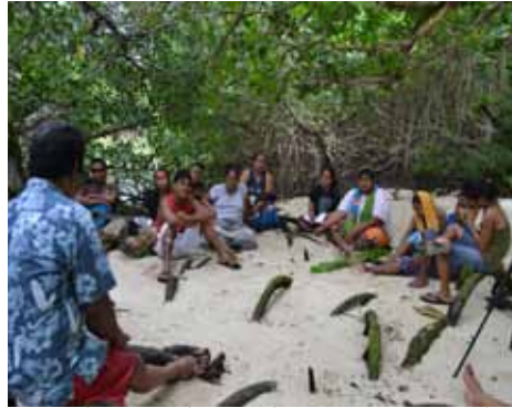
Peer educators sharing their experiences with the student participants