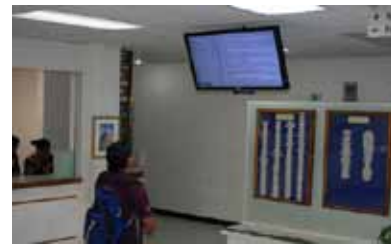
A student looking at his class schedule from the information panel