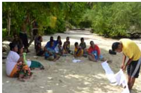
Counselors and students conducting group activities on the island as part of the program