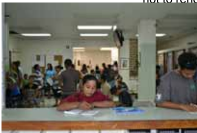
Students Registering at National Campus

Administration Building. The information panel pilot project will be used to deliver college related information for visitors to the campus. The panel will display news, emergency alerts, event announcements and other information from the college.